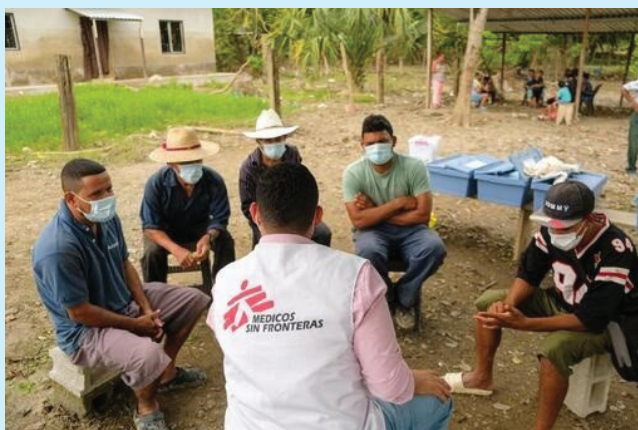
MSF staff dialogue with groups of men about the damage left by Hurricanes Eta and Iota in Honduras.