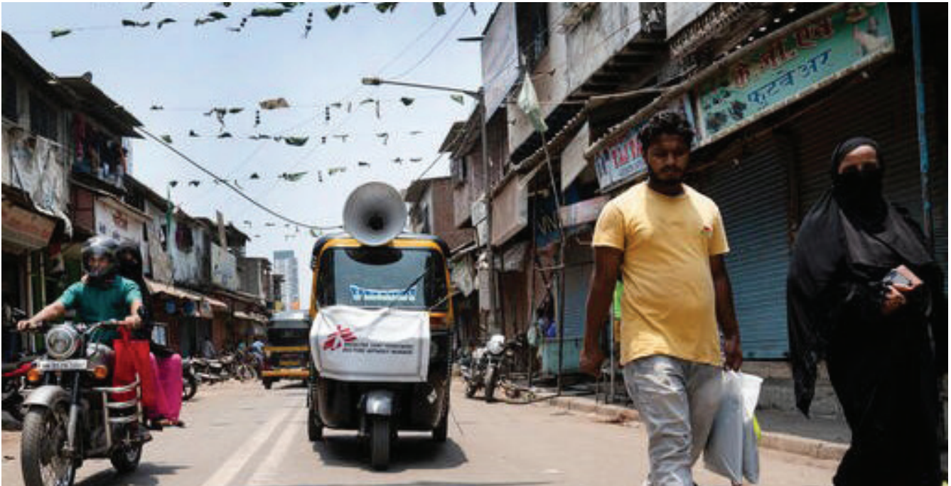
An auto-rickshaw visiting alley lanes of Mumbai's M-East Ward to raise awareness about COVID-19. Already struggling with public health issues like high rates of HIV and TB and two devastating waves of the COVID-19 pandemic, parts of India have experienced record-breaking heat this year. 5