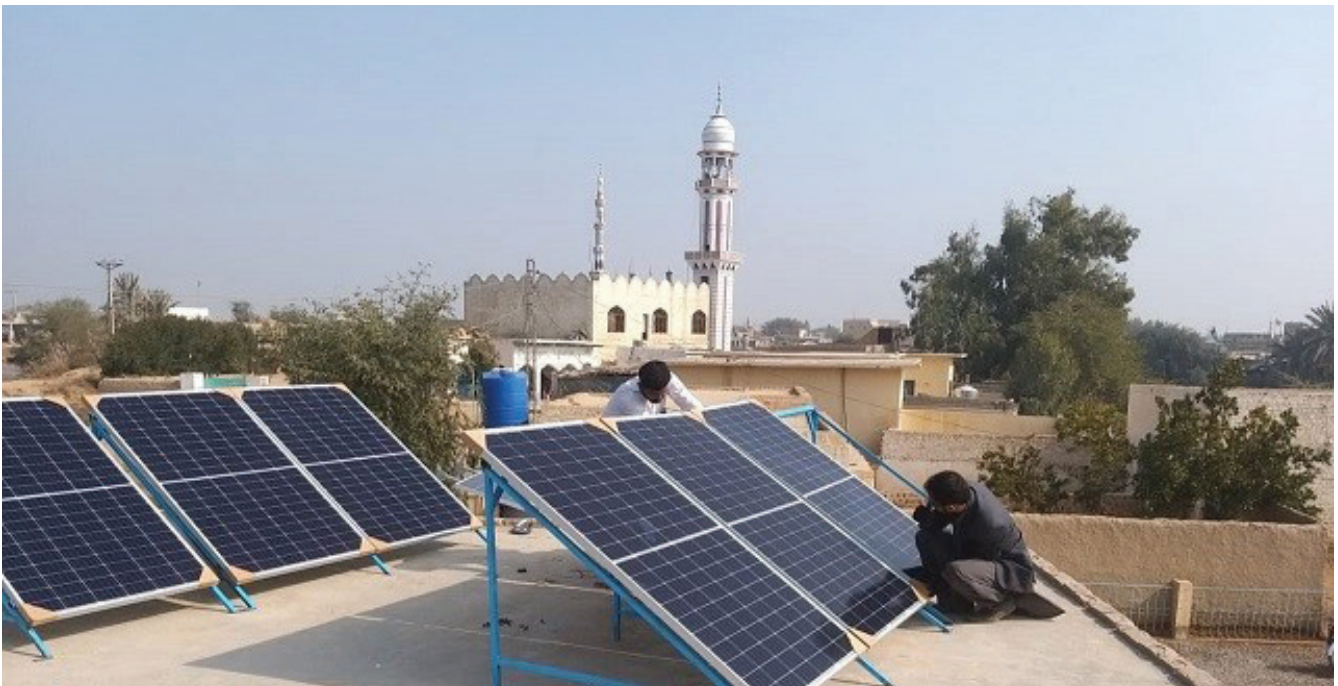
MSF technicians install solar panels on the roof of a hospital compound in Balochistan, Pakistan.

Increasing demands on a deteriorating energy distribution system mean that people in Balochistan now face power outages of up to 18 hours a day. The provincial government has announced plans to adopt solar technology throughout the public sector, 50 signalling opportunities for cooperation and skills transfer between MSF and local actors, and potential energy efficiency gains within the province's health care system.