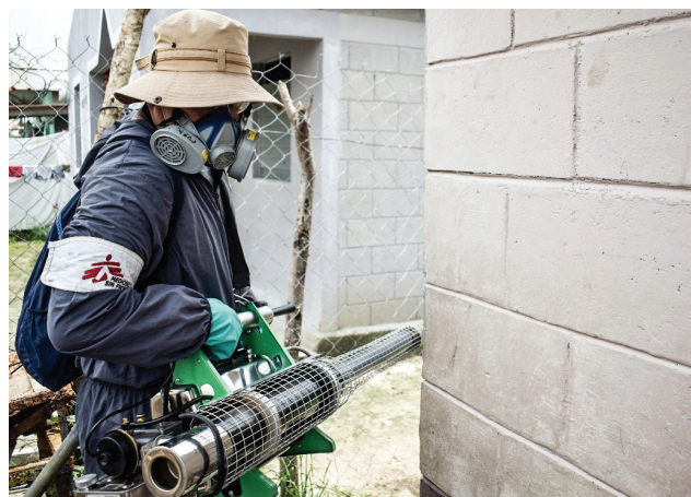
An MSF staff member carrying out fumigation activities against dengue in the northern part of Honduras.

There is a clear need for systems that are adapted to face emerging health issues related to climate change. 35,36 Investments in health infrastructure, epidemiological surveillance and data collection, and primary and psychosocial care and prevention are essential to improve resilience. 37 As in the case of Honduras, a country heavily impacted by the climate crisis, strengthening health systems now could mean protecting health in years to come.