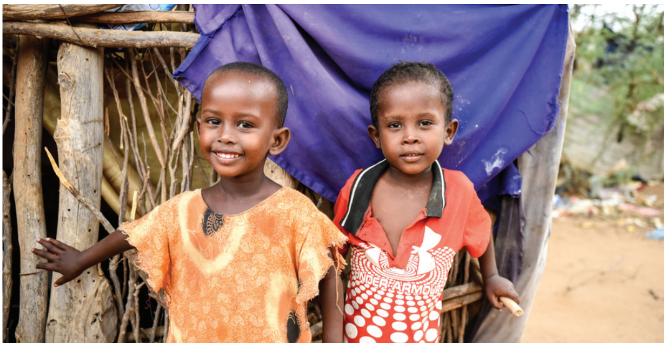
Children pose for the camera at Dagahaley camp, Dadaab, Kenya. During the conflict in Somalia in the 1990s and a nutrition crisis in 2011, thousands of Somalis settled in Dagahaley camp. Because of insecurity and precarious living conditions in Somalia, many have never returned.