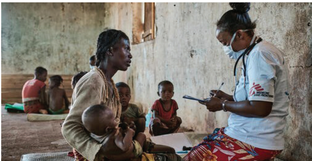
People in the south-east of Madagascar are facing the most acute nutritional and food crisis the region has seen in recent years. MSF began setting up mobile clinics in Amboasary district in late March to screen and treat acute malnutrition in remote villages like those of Ranobe commune, providing ready-to-use therapeutic food and medical care.