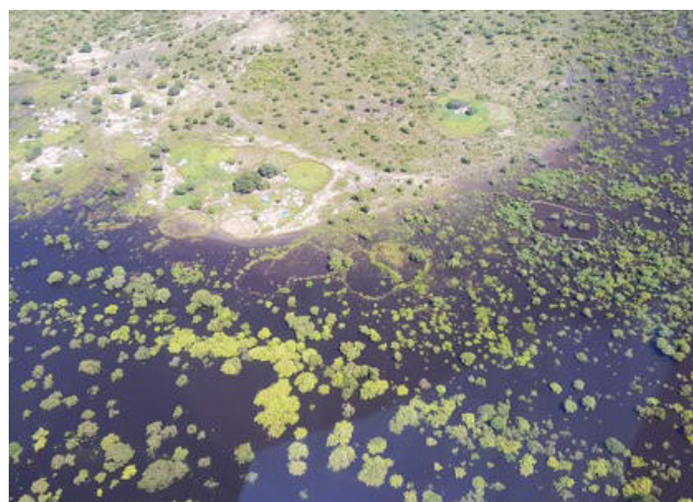
View from Bor to Pibor, South Sudan, during flooding in 2019. In Pibor, outbreaks of violence and severe flooding regularly forced MSF to suspend its medical activities and required large-scale repairs of damaged facilities. In June 2020, MSF closed its clinic and reoriented its programme in Pibor to be more responsive to the changing health needs of this community.