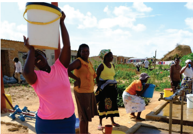
Women fetching water at a water point in the informal settlement of Stoneridge in Southern Harare, Zimbabwe. MSF's Environment and Health Service Delivery Project (ZimHub) has piloted innovative techniques to improve environmental health in Zimbabwe, including drilling the solar-powered borehole feeding this water point. The site is now maintained by the local community health club after training by ZimHub teams.

The road to decarbonisation presents considerable challenges, and indeed opportunities, for MSF – an emergency medical organisation whose work is intrinsically carbon-intensive. Adapting our modus operandi while ensuring continued emergency response capacity is a major task requiring systematic change, inclusive action and determination.